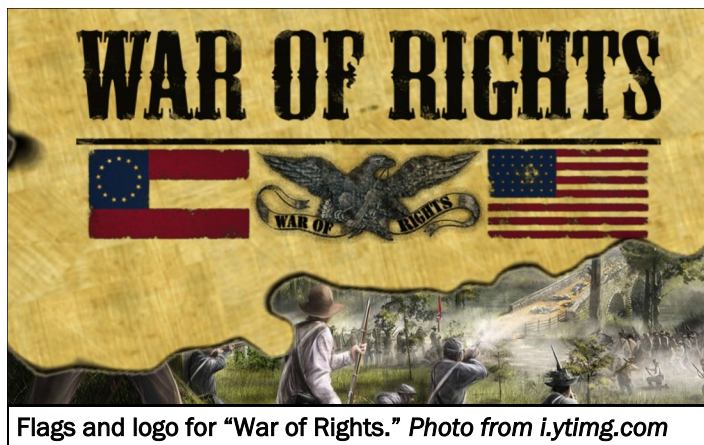
Flags and logo for "War of Rights."

War of Rights also has multiple battlefields to choose from. From the Siege of Harper's Ferry, to the Battle of Antietam, players will be able to choose from