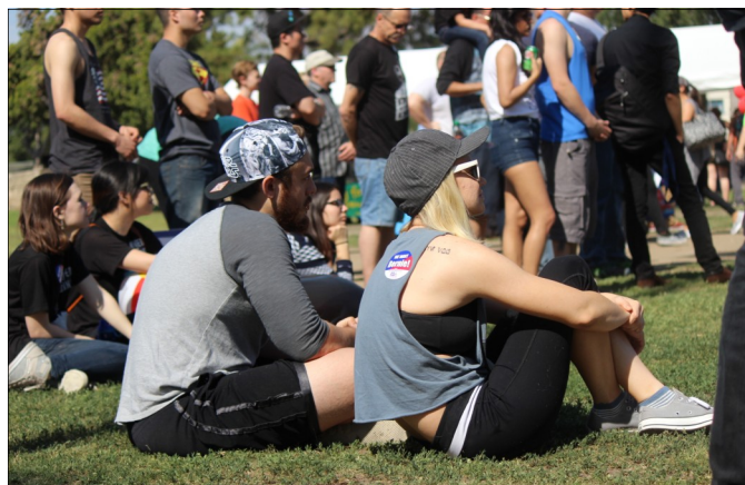
Top: Parents of three support Sanders. Bottom: Young supporters Listen to speakers.

They all seemed to believe in basic freedom, the access to healthcare and education and the ability to empower oneself through political involvement.