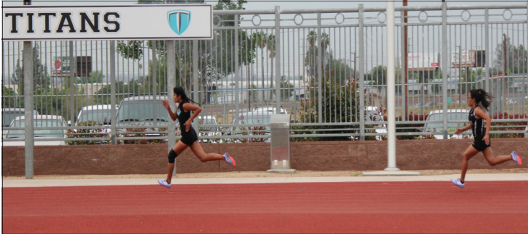
Titan Track Team members sprint for time against Colton on April 7.