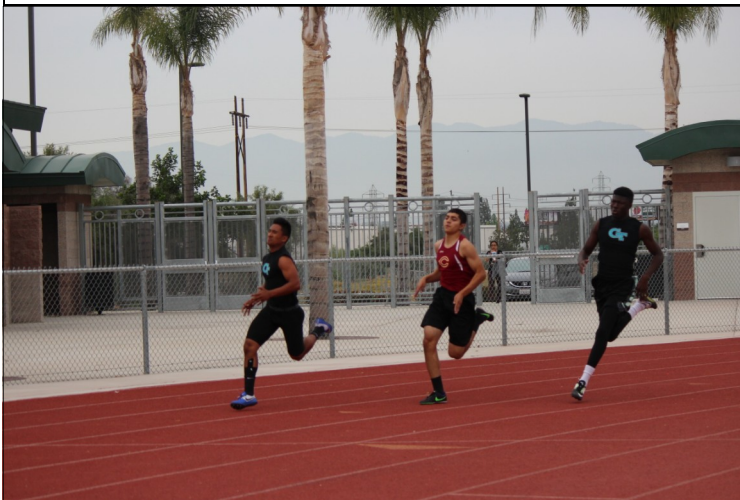
Titan Track team members lead the pack against Colton. On April 7.